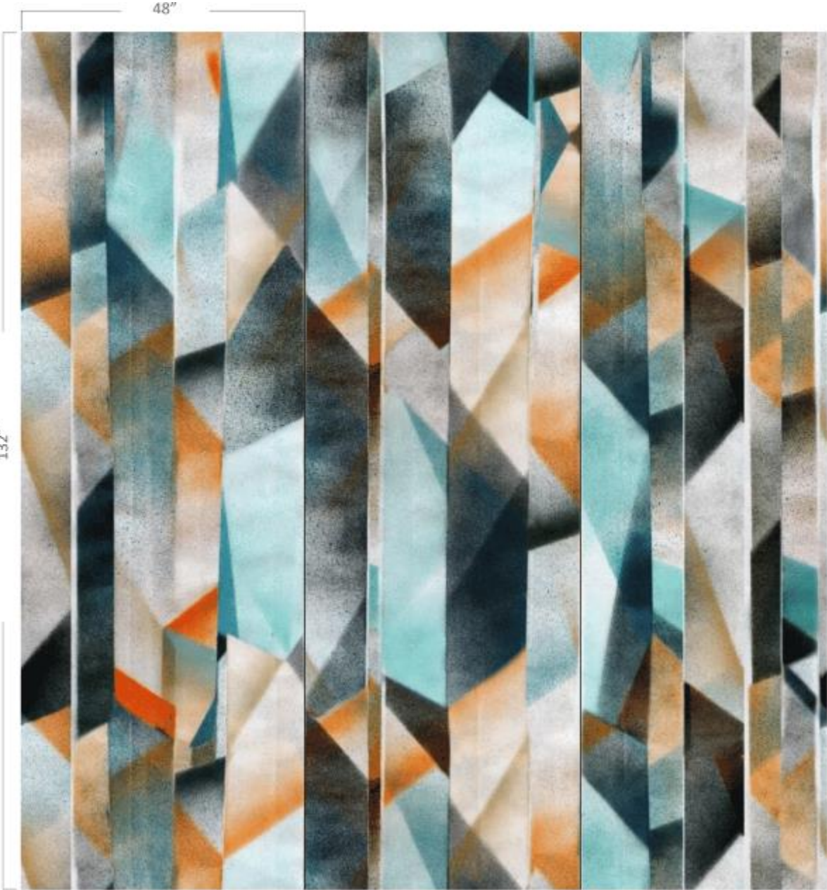
Pattern Repeat Diagram (in color):