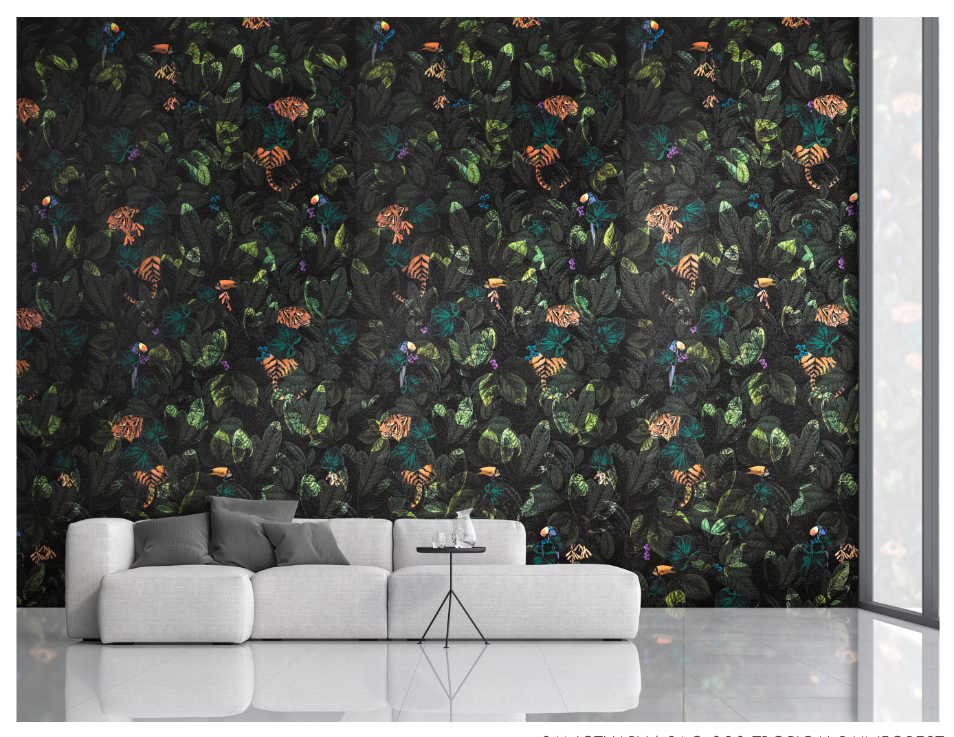
SANCTUARY | SAC-003 TROPICAL RAINFOREST

As fashion draws life from the animal kingdom, the journey continues to interiors.